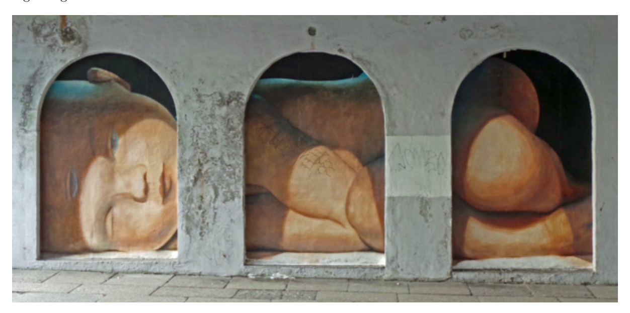
"Awakening": paste-up, Smørsbroen, Bergen, Norway; 2016.

AFK made the large-scale "Awakening" on a wall next to a busy thoroughfare in Bergen in 2016. The "piece" became a cherished part of an otherwise unexciting building surface, and when it was finally removed by the National Roads Authority it caused an outcry, culminating in a change in their policy regarding street-art.