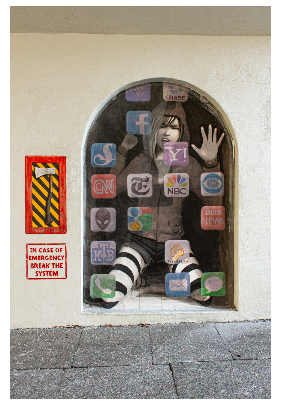
"In case of emergency, break the system": paste-up, Smørsbroen, Bergen, Norway; 2016.

AFK's work often ventures into the realm of commentary, making surprising connections between familiar images and apt statements in our present condition, such as in this paste-up from 2016.