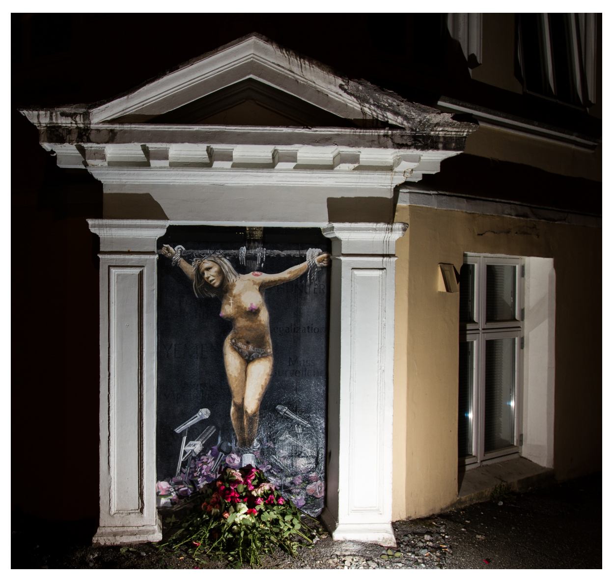
"Making a martyr – distraction by polarization": paste-up, Hans Holmboes gate and Foss-winkelsgate, Bergen, Norway; April (Easter) 2018.

During Easter last year this piece by AFK, showing a crucified Norwegian Minister of Justice Sylvi Listhaug, emerged on a wall in Bergen shortly after her resignation. It became a hotly debated image in the national media, not in the least because of its ambiguous message.